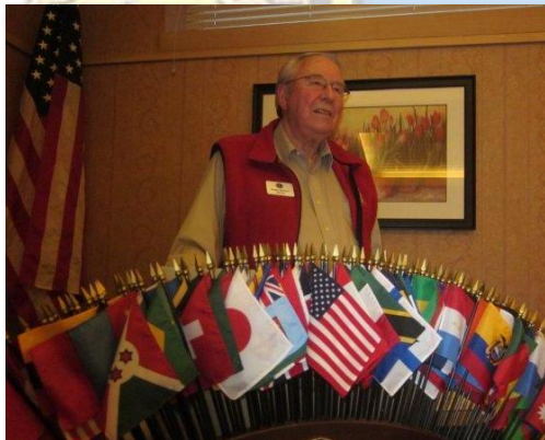
Even looks like a King Lion.