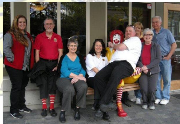
Our RMH Kitchen Krew. (Check out the sox)